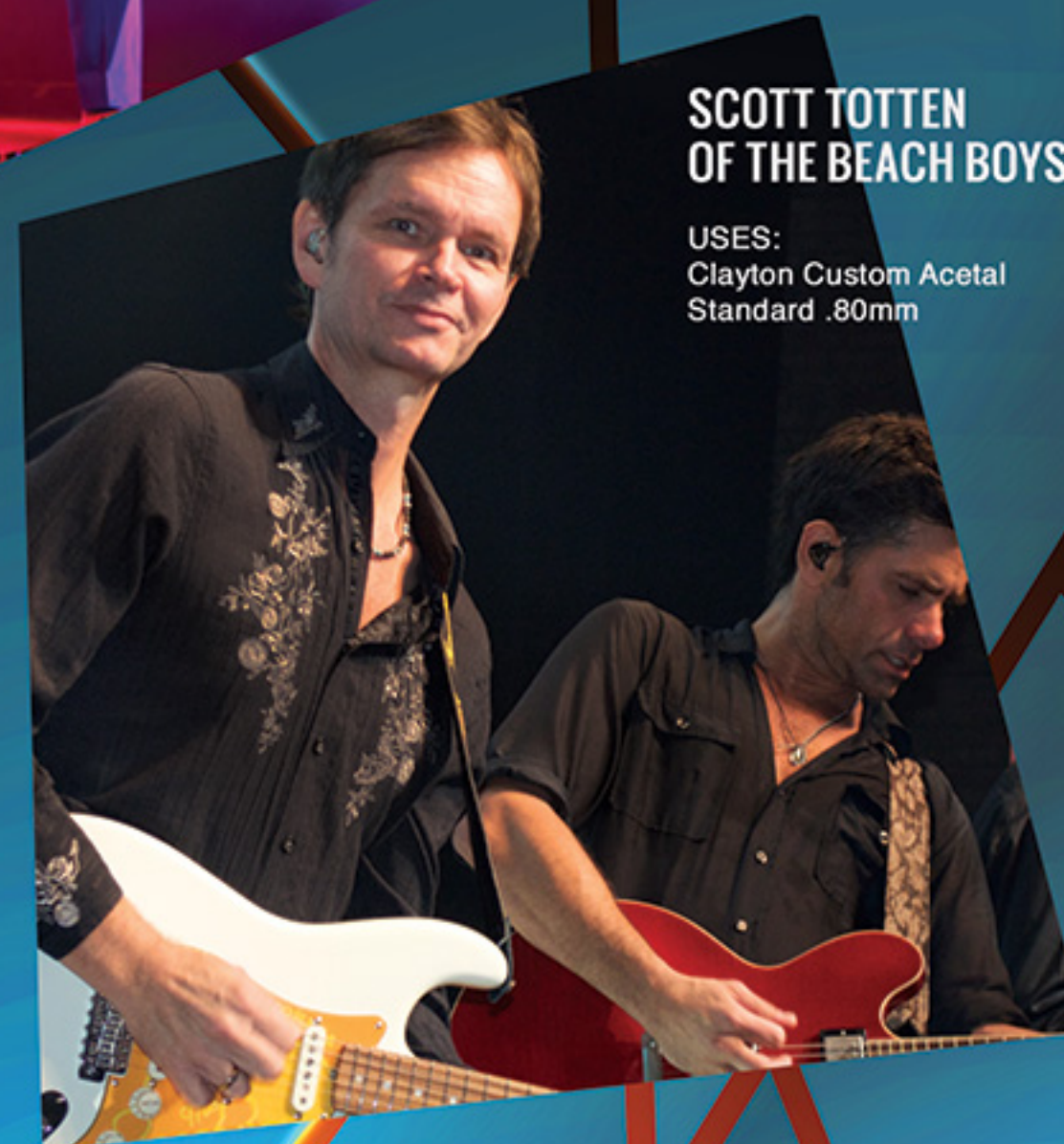
SCOTT TOTTON OF THE BEACH BOYS

USES: Clayton Acetal Rounded Triangle .80mm