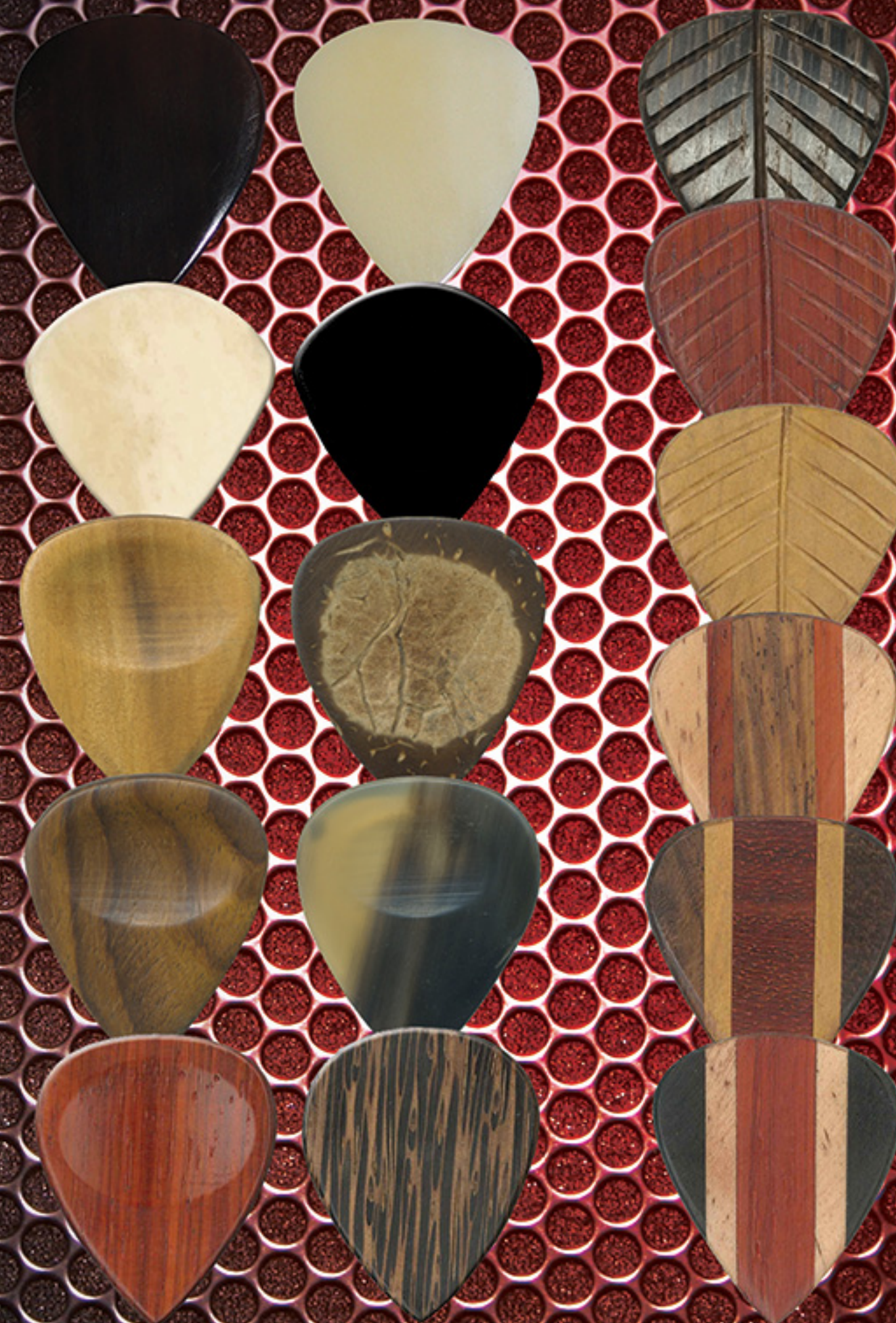
Packaging : 3 picks per pack

Wenge Wood: Wenge wood is a beautiful wood featuring black stripes against a rich brown background. Wenge wood creates a strikingly bright sound against your strings. Each pick is handmade to ensure all edges are smoothed to perfection.